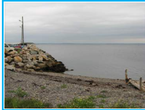
Wharf and beach at Big Tancook

This large island and nearby Little Tancook are a delight to visit. Big Tancook is about 5km long and crisscrossed with dirt roads, trails, fields, woods and colourful old homes. It has been a fishing community for generations and still has year-round residents and a small one room school house. For a good map showing Big Tancook Island and further touring details, see Page 47-49 of the book Paddle Lunenburg-Queens .