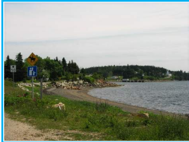
Beach at Shoal Cove, Blandford

Easy to difficult depending on surf conditions. Use caution.