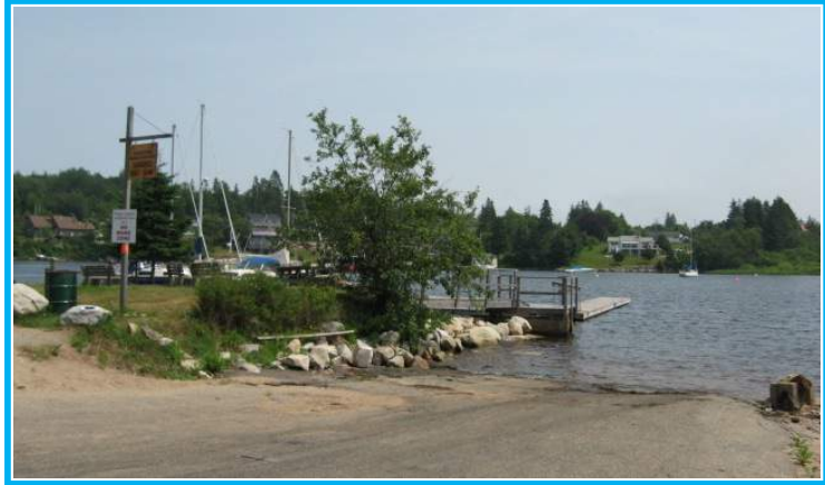
Launch ramp at Hubbards

Amenities at site Parking, Toilet (Port-a-Potty), Garbage Cans, Picnic Tables