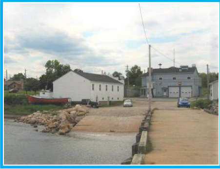
Government wharf ramp