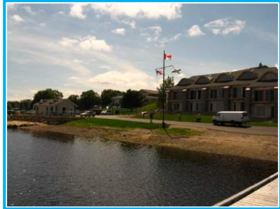
Oak Island launch area

Protected, gently sloping sand beach about 20 m wide in front of marina office building.