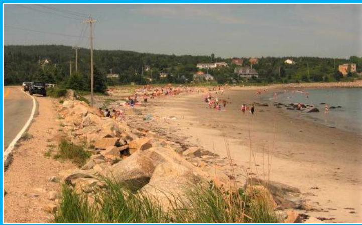
Bayswater Beach on a warm summer day.

This park has a long sandy beach and is the first accessible take out after rounding the tip of the Aspotogan Peninsula from Blandford.