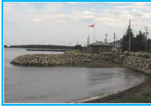
Wild Rose Park

The best launch site for boats is at the government wharf. There are also options at Wild Rose Park which runs north from the wharf about 1 km. For a good map showing Western Shore and further touring details, see Page 22-24 Paddle Lunenburg-Queens .